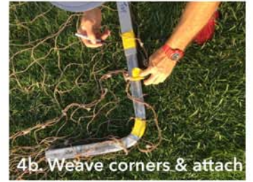
4b. Weave corners & attach

5. Repeat the same with the 2 straight side bars - weave and attach.