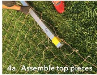
4a. Assemble top pieces

4. Assemble the goal top (5 straight pieces) and weave them through the top of net. Then weave the net thru the top corner parts and connect them to the assembled goal top.